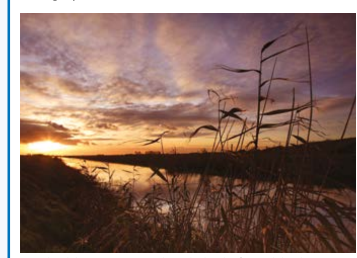
A Fenland drain at sunset – where the land is flat and the skies are big ...

The peaty land surrounding the town is drained by several large ditches and dyke's and there are two large drainage rivers near the town – The Forty Foot Drain (Vermuyden's Drain) and The Sixteen Foot Drain, and these are still key in supporting the local drainage system.