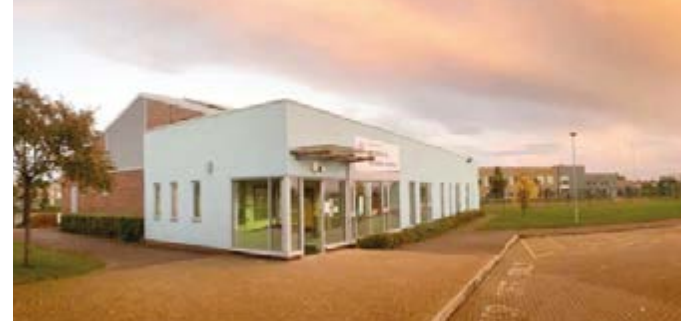
Chatteris Leisure Centre

A well-equipped gym with the latest equipment and fully-qualified