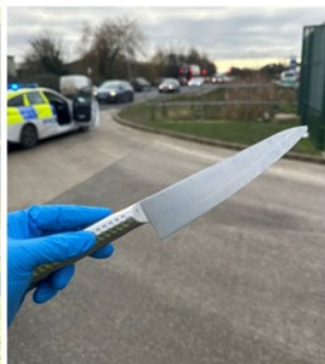
Knife recovered from man in Cromwell Rd