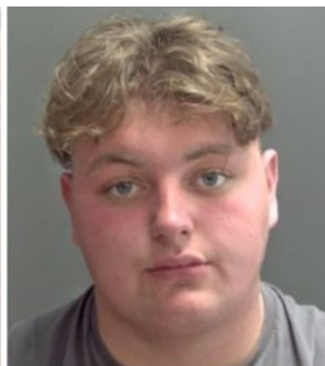
Criminal Behaviour Order for anti-social rider