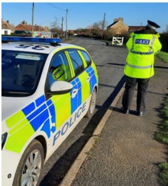
Speed checks in Wimblington, Benwick & Coates