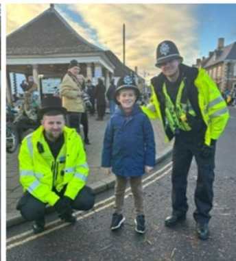
Strawbear Festival in Whittlesey