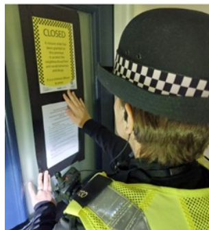
27 King Street "closed" following ASB