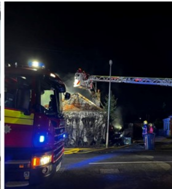
Support with bungalow fire in March