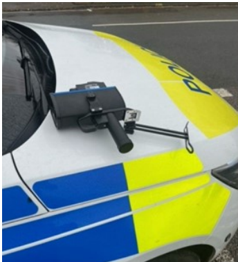
Speed checks in Chatteris