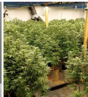
Cannabis factory found in Castle Mews