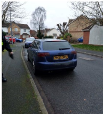
Disqualified driver has car seized in March