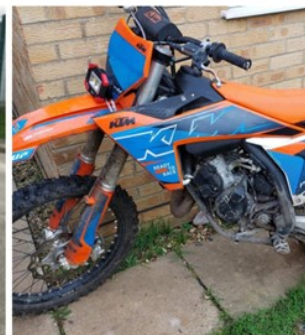
Bike seized from anti-social rider in Wisbech