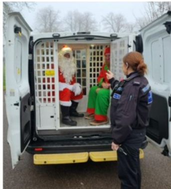
Visit to Doddington Christmas fair