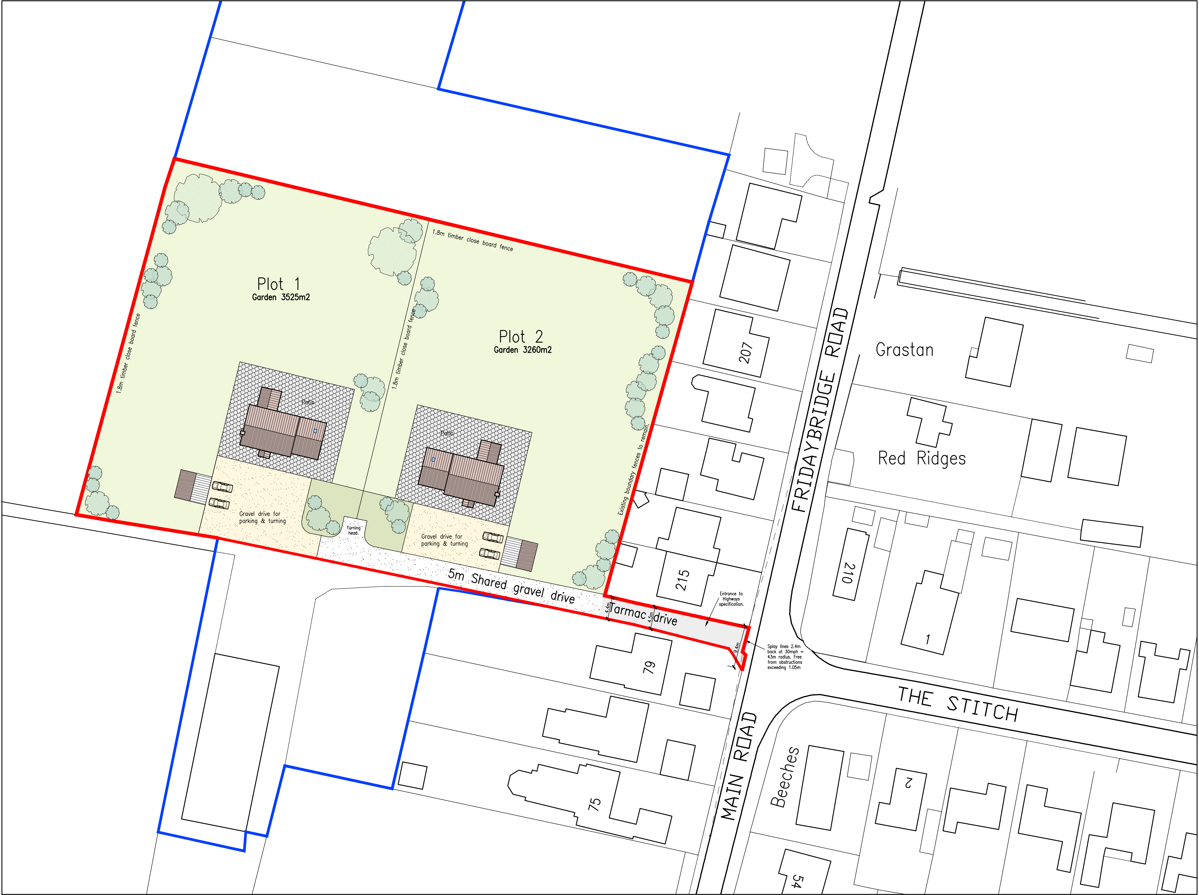
Indicative Site Plan 1:500