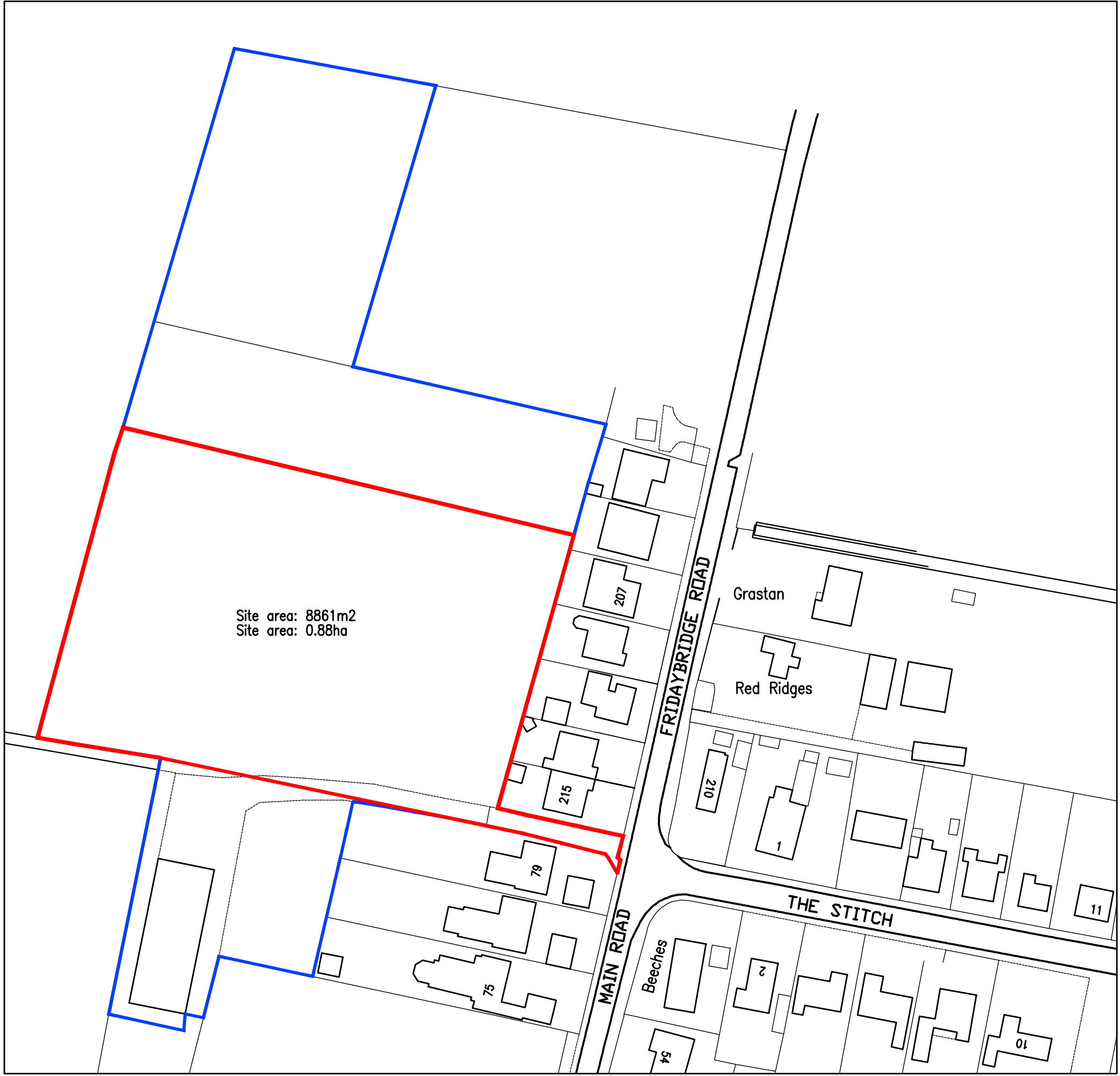
Location Plan 1:1000

Peter Humphrey Associates Ltd. ARCHITECTURAL DESIGN AND BUILDING