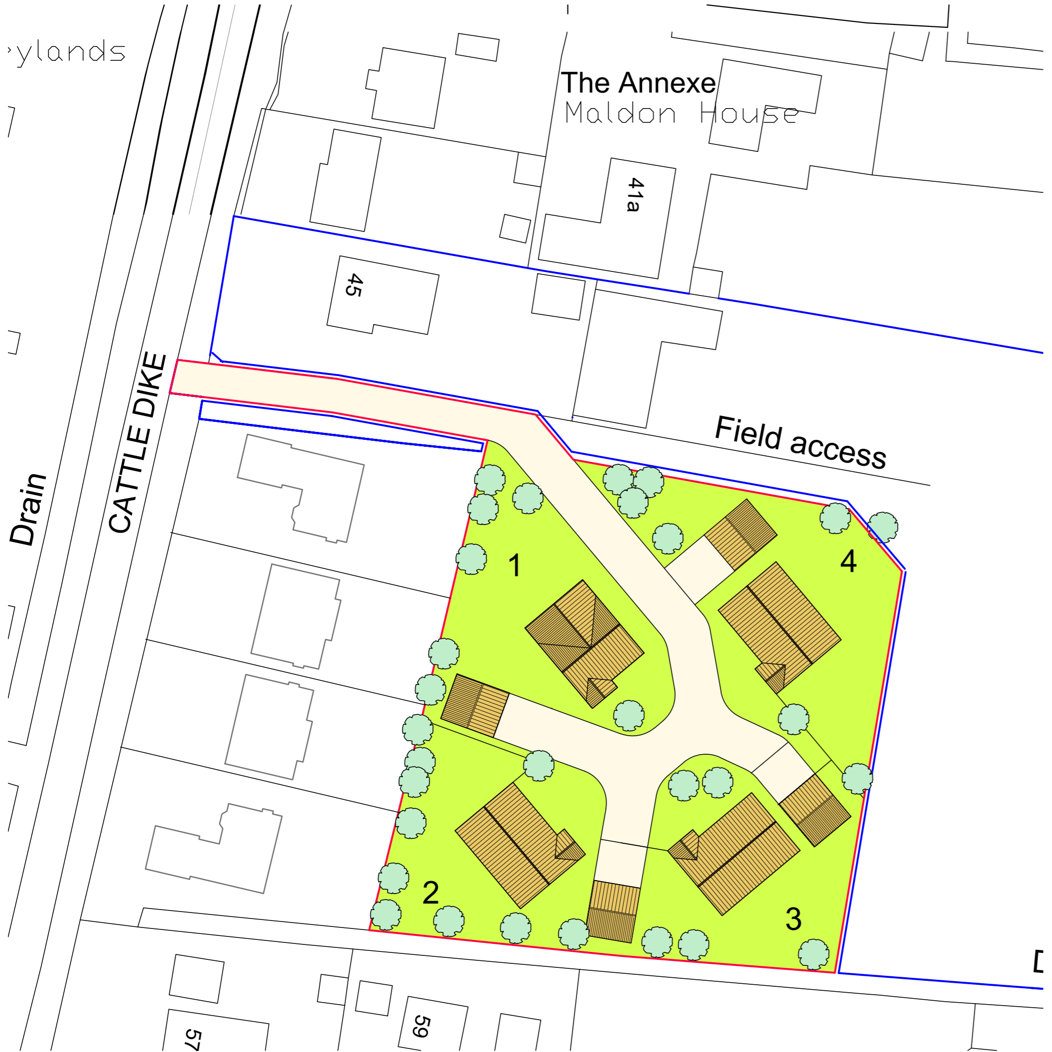
SITE PLAN 1:500(Indicative only)